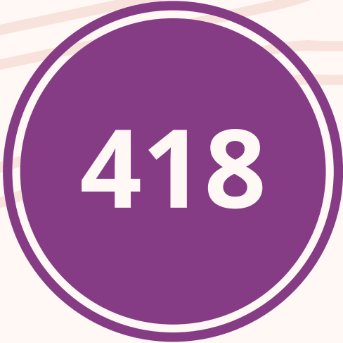
STUDENTS FOR 22-23

TOTAL NUMBER OF HOURS OF MONTESSORI INSTRUCTION